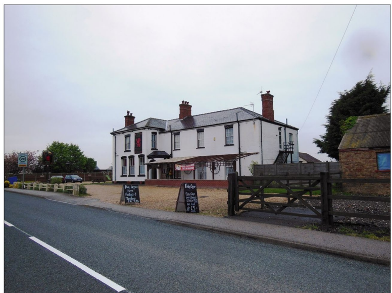
The Red Lion, 2013